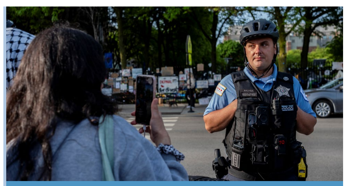
Police break up pro-Palestinian encampment at DePaul university Chicago.