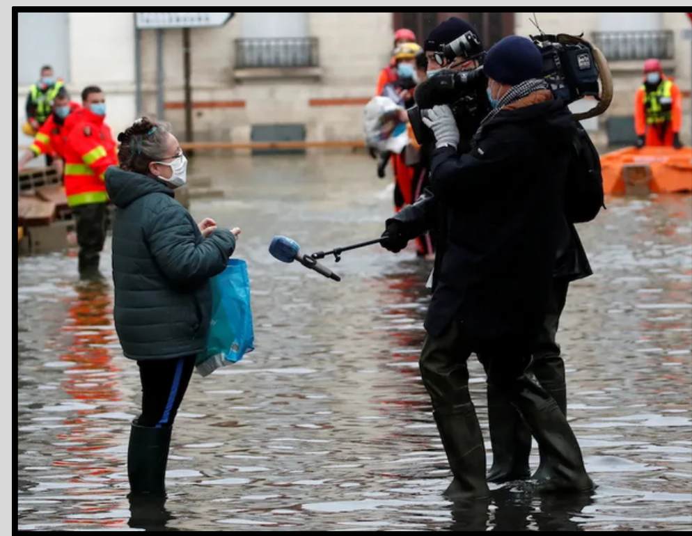
Journalists report in a flooded area.