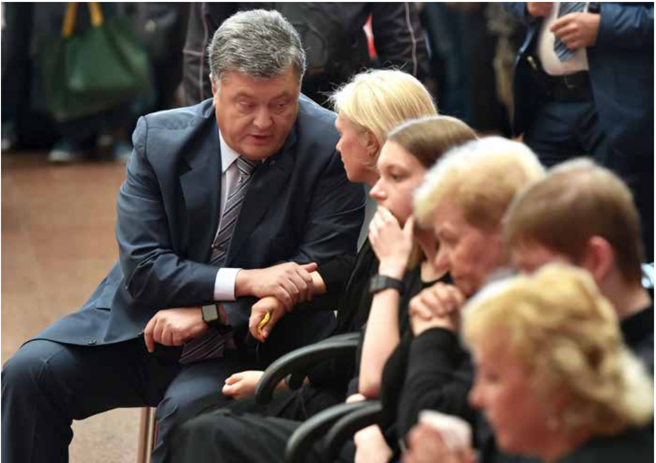
President Petro Poroshenko talks with relatives during a memorial in Kiev for Pavel Sheremet. The president promised a swift investigation, but to date no suspects have been identified.