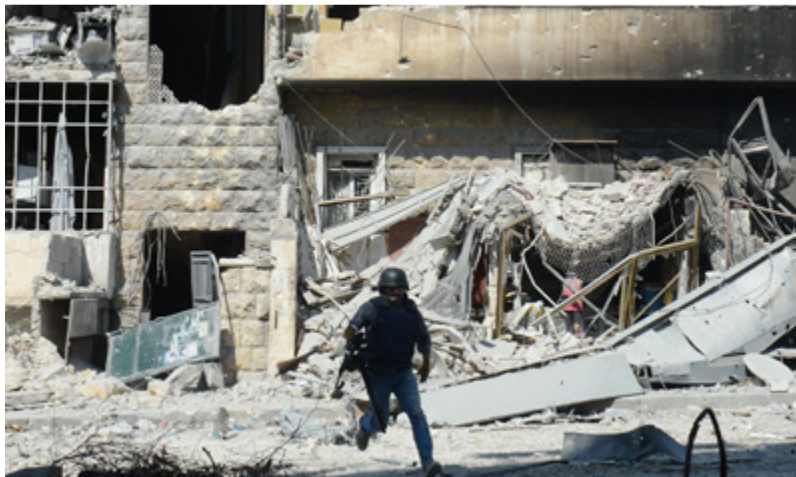
A journalist dodges gunfire in the Syrian city of Aleppo.