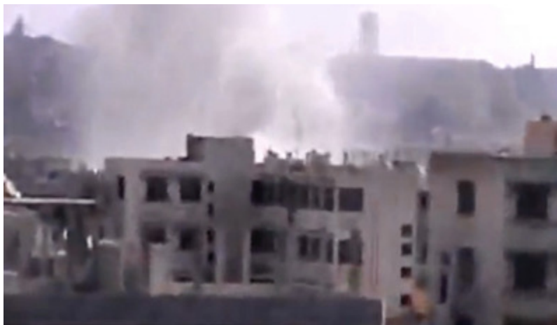
An image from a video published by the Shaam News Network shows smoke rising from buildings in Homs destroyed by government shelling.

With international journalists blocked and traditional domestic media under state control, citizen journalists picked up cameras and notepads to document the conflict—and at least 13 of them paid the ultimate price. One, Anas al-Tarsha, was only 17 years old. At least five of the citizen journalists worked for Damascus-based Shaam News Network, whose videos have been used extensively by international news organizations.