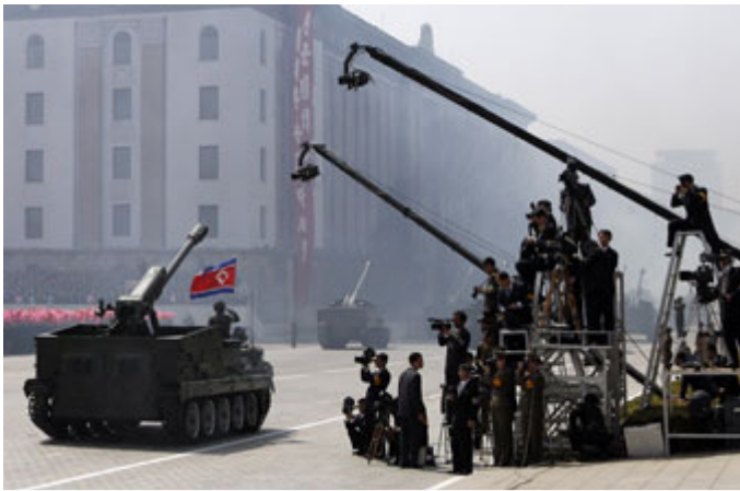
A North Korean tank moves past local journalists during an April military parade in Pyongyang.

No foreign reporters are granted access to Eritrea, and all domestic media are controlled by the government. Ministry of Information officials direct every detail of coverage: "Every time [a journalist] had to write a story, they arrange for interview subjects and tell you specific angles you have to write on," an exiled Eritrean journalist told CPJ, speaking on condition of anonymity for fear of reprisal. "We usually wrote lots about the president so that he's always in the limelight." So when President Isaias Afewerki dropped out of public view for a time last month, his citizens and the international community were left with only rumors about his well-being.