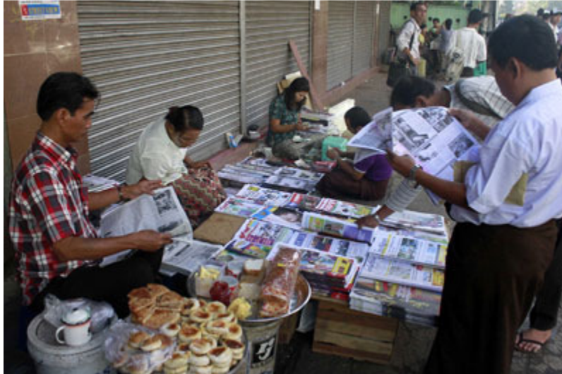
Newspapers on sale in Rangoon. Censorship is so extensive that papers cannot publish more than weekly.

Leadership: President Thein Sein, a former general who assumed office in a 2011 election that heavily favored military-backed candidates