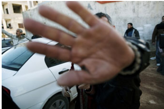
A photographer is obstructed as people flee a Syrian Army attack in Idlib in March.

Among the list of 10 most censored, Saudi Arabia is a new entry. Cuba dropped from seventh in 2006 to ninth this year as authorities recently released more than 20 imprisoned journalists and a vibrant (though persecuted) community of independent bloggers has emerged. Burma has moved from second on CPJ's previous list to seventh on this analysis because it, too, released a number of imprisoned journalists and informally loosened, at least temporarily, restrictions on reporting for locals and foreigners alike.