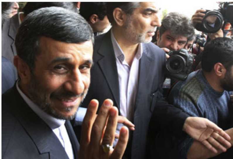
President Mahmoud Ahmadinejad has a wave and a smile for the media, even as his government imprisons journalists under horrific conditions.

Leadership: Ayatollah Ali Khamenei has been supreme leader since 1989. Mahmoud Ahmadinejad first won the presidency in 2005.