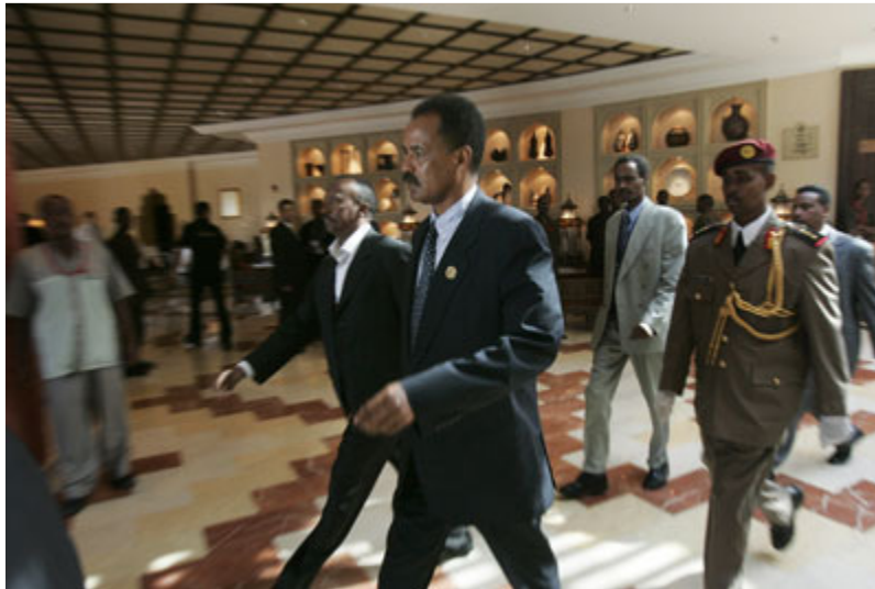
President Isaias Afewerki has held off elections and the implementation of a constitution since 1993.

Leadership: President Isaias Afewerki, in power since 1993