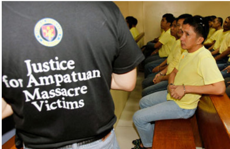
An advocate for the Maguindanao massacre victims appears at a court hearing near several police officers charged in the killings.