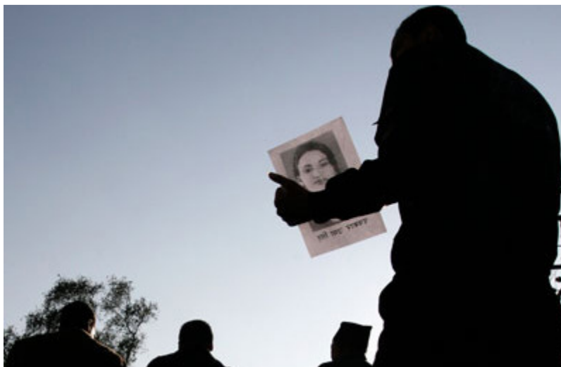
Advocates for the slain journalist Uma Singh are buoyed by recent convictions in the case.